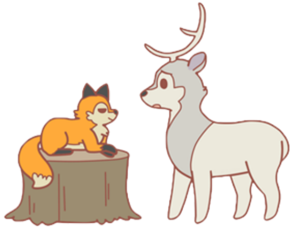
While pixelated, this game does contain: